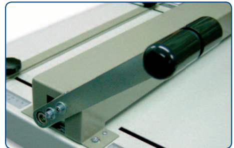
User friendly handle