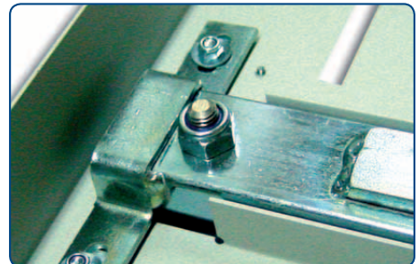
Adjustable creasing power