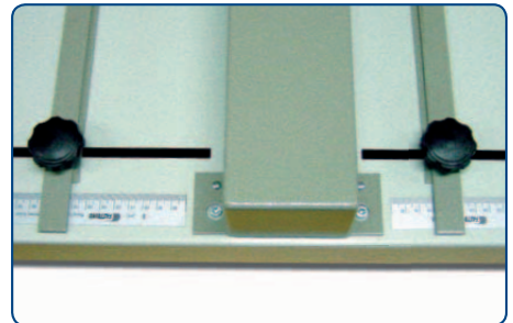
Two alignment bars